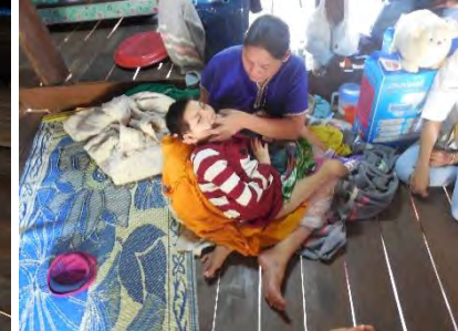
Providing incontinence support for those in desperate need who are unable to help themselves