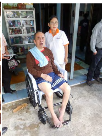
3 more wheelchairs fo elderly disabled at Muang Gee, November 2015