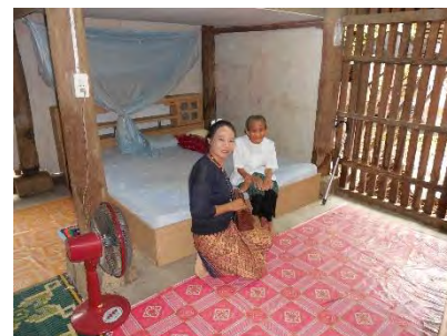
New beds & bedding for blind sister & brother plus new ground floor bedroom for 90 year old lady