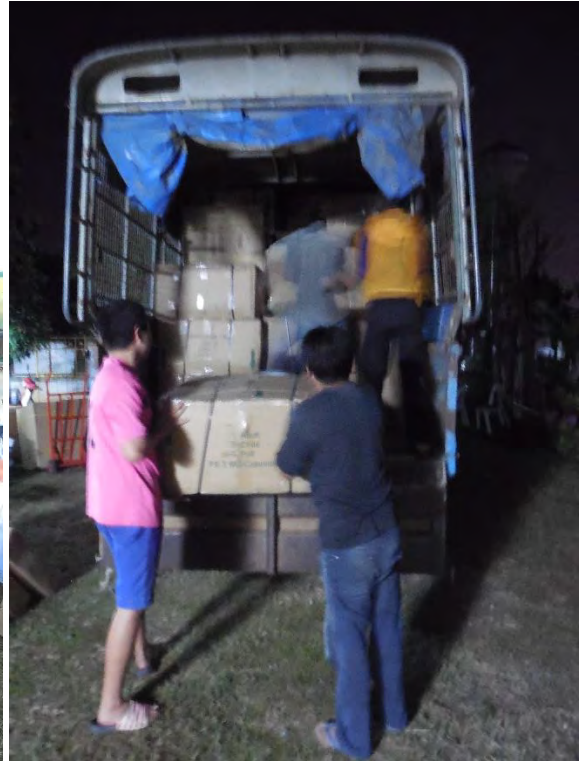
65 mobility aids headed for the Burma/Lao/Thailand border & loaded in the dark –Dec 1, 2015