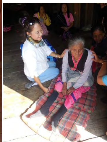
Above recipients include retardation, Alzheimers, and Cerebral Palsy survivors