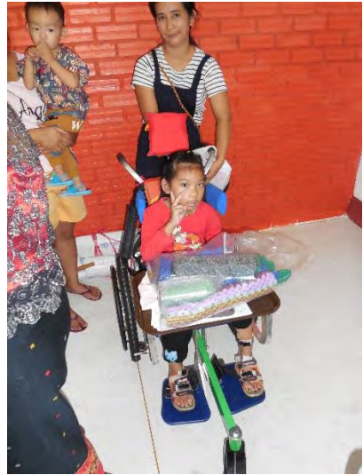
Tricycle cart donations at Mae Sai on Burma border