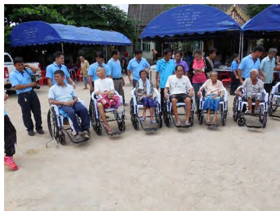
Before and after wheelchair donations at Mae Ka "Disabled Day" party